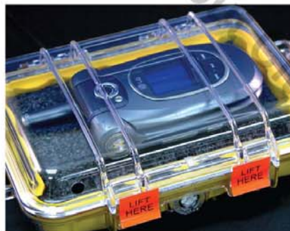
Top: Pelican case pre-modification Bottom: Pelican case after-modification